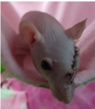
Soft after surgery