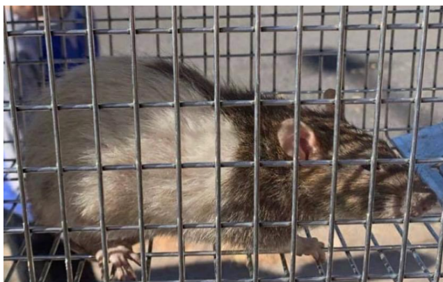
Flight departs Flagstaff