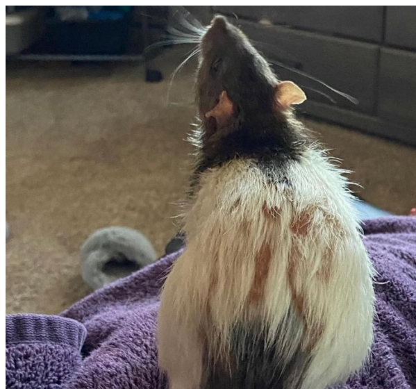
Flight's hair growing in after being shaved