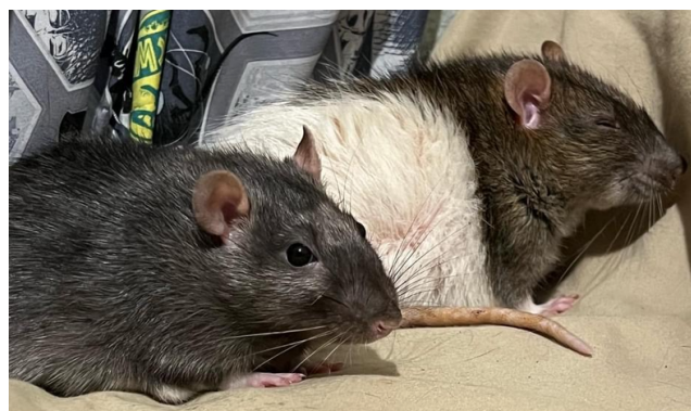
Flight today with his new companion